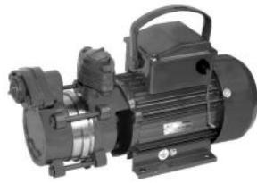
Power Gold - 1 / 2 / 2A