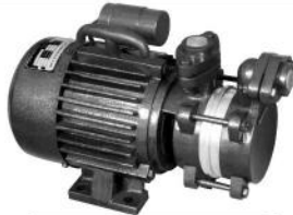
Deluxe - 70 (Rib body)