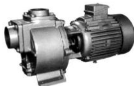
Mud Monoblock Pump