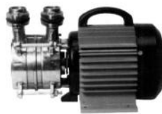
Stainless Steel Monoblock