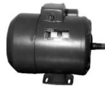
Single Phase Motor 0.25 HP to 3 HP