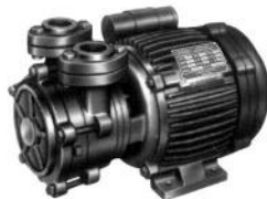
Deluxe - 80