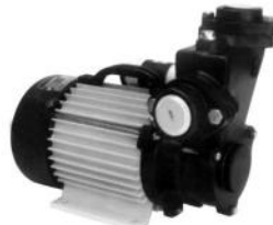
Super - 70 / 100 / 120