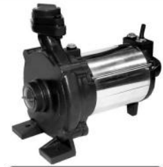
ASM - 1CG / 3CG / 4CG / 5CG