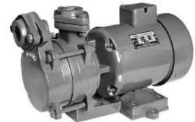
Heavy Duty (0.5 H.P. & 1 H.P.)