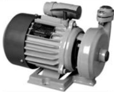
Mono - 60