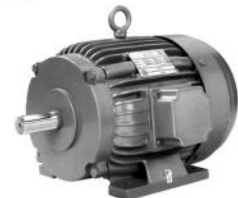
Three Phase Motor 0.25 HP to 60 HP