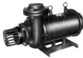
Three Phase Openwell (0.5 H.P. to 15 H.P.)