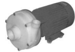
PP Monoblock Pump