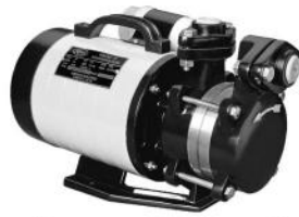
Deluxe-70 / Power Gold-2 Cl