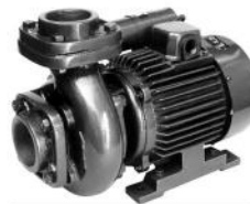
ACF Series LH 0.5 to 10 H.P.