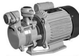
Deluxe - 90 / 100