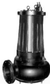
Dewatering sewage pump