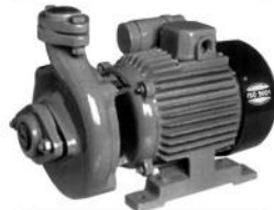
ACF Series HH 0.5 to 10 H.P.