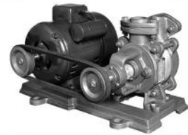
Belt Drive 0.5 to 2 H.P.