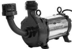
Single Phase Monoset (0.5 H.P. to 5 H.P.)