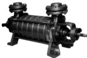
Multistage Self Priming Pump