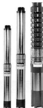
V-3, V-4, V-6 Sub. Pump